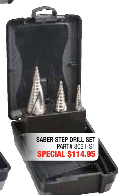
4-12mm, 4-20mm, 4-30mm HSS Spiral Flute Hex Shank Step Drills