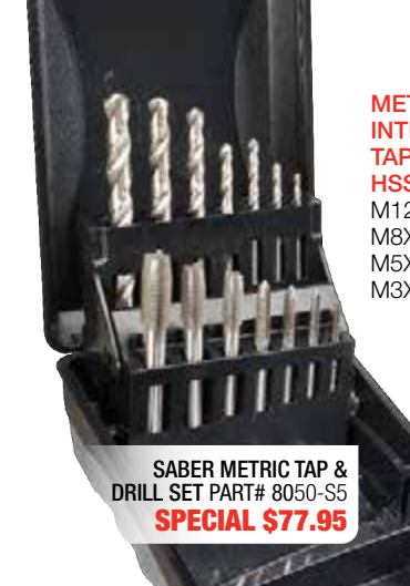
METRIC COARSE INTERMEDIATE LEAD TAPS AND MATCHING HSS JOBBER DRILLS M12X1.75, M10X1.50, M8X1.25, M6X1.00, M5X0.80, M4X0.70, M3X0.50