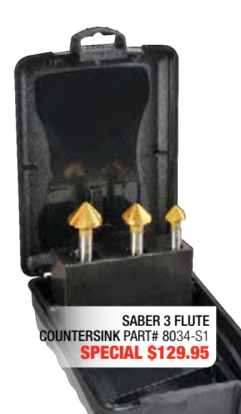
16, 20 and 25mm HSS-Co5 (Cobalt) TiN Coated Triple Flute Countersinks