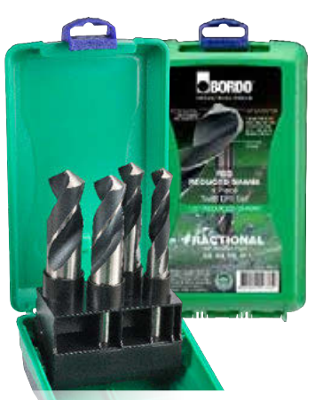
FRACTIONAL REDUCED SHANK DRILL SET PART# 2651-S1 SPECIAL $194.95