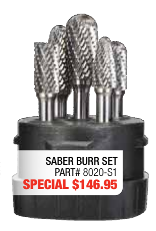
SB3, SC3, SC5, SF3 and SF5 1/4" shank Tungsten Carbide Burrs