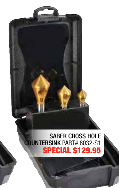
15, 21 and 28mm HSS-Co5 (Cobalt) TiN Coated Cross Hole Countersinks