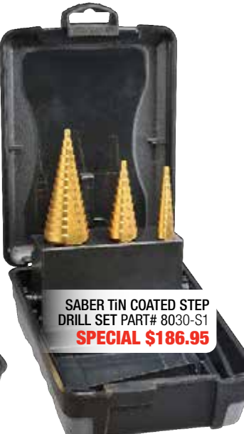
4-12mm, 4-20mm, 4-30mm HSS TiN Coated Step Drills